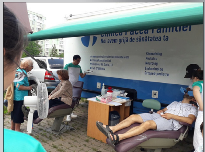
MEDICAL & DENTAL MOBILE UNIT

"YOU ARE THE LIGHT OF THE WORLD. A TOWN BUILT ON A HILL CANNOT BE HIDDEN. NEITHER DO PEOPLE LIGHT A LAMP AND PUT IT UNDER A BOWL. INSTEAD THEY PUT IT ON ITS STAND, AND IT GIVES LIGHT TO EVERYONE IN THE HOUSE. IN THE SAME WAY, LET YOUR LIGHT SHINE BEFORE OTHERS, THAT THEY MAY SEE YOUR GOOD DEEDS AND GLORIFY YOUR FATHER IN HEAVEN."