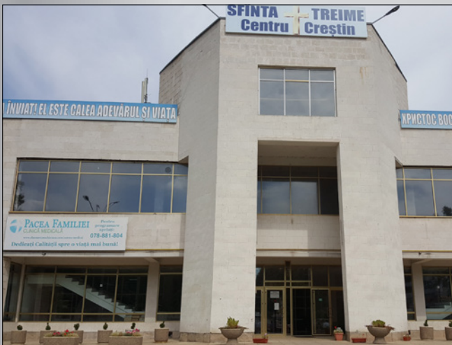
PACEA FAMILIEI CLINIC